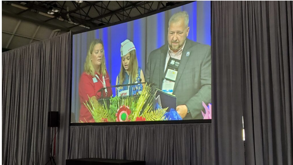
Buddy Poppy Child, Aurora addresses the VFW

Kids should be kids. We know when mom and dad are suffering the children suffer with them. We want to remove that suffering."