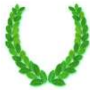
Laurel Wreath: Victory Over Death