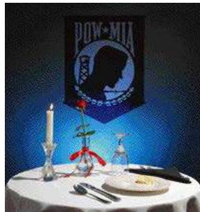
THE TABLE CLOTH IS WHITE THERE IS A SINGLE ROSE THERE IS A RED RIBBON AROUND THE VASE

Let us now rise and raise our glasses in a toast to honor America's POW/MIAs and to the success of