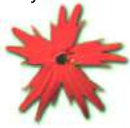
Red Flower: Courage and Gallantry