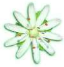
White Flower: Devotion to Duty